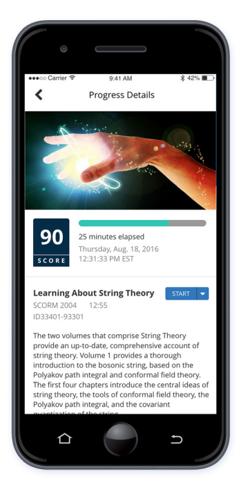
View critical team metrics to cultivate the performance of direct reports